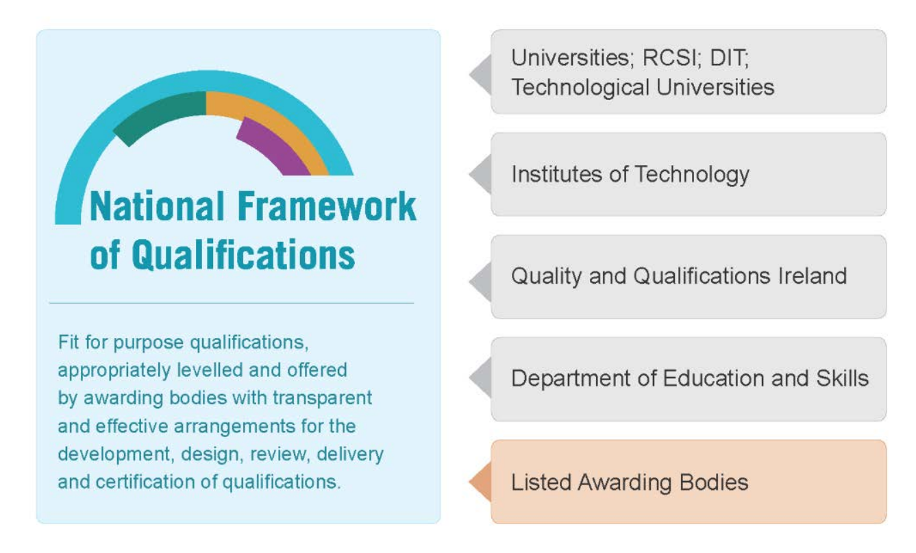
Figure 2: The proposed range of awarding bodies with regulated access to the Framework

Importantly, the proposed scheme for 'listing awarding bodies' will be voluntary. There is evidence of demand for this new route to the Framework. Listed awarding bodies will have the opportunity to offer their qualifications within the public education and training system. This will facilitate access to the Framework for a broader range of awarding bodies. It is also intended to achieve wider system benefits, by creating more and better qualifications pathways for learners, enhancing learner mobility and progression opportunities and promoting fair recognition of learning achievements. In addition, this