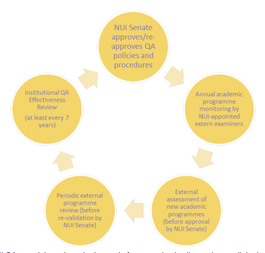
Figure 1: NUI QA oversight and monitoring cycle for recognised colleges that are linked providers