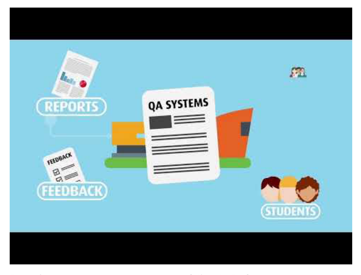
Figure 1: Quality assurance - what it is and why it matters [1:48 min, YouTube]

This handbook is also intended as a guide to the process for review team members, but comprehensive detail about the review team's role in the cyclical review process is issued to the team in separate documentation.