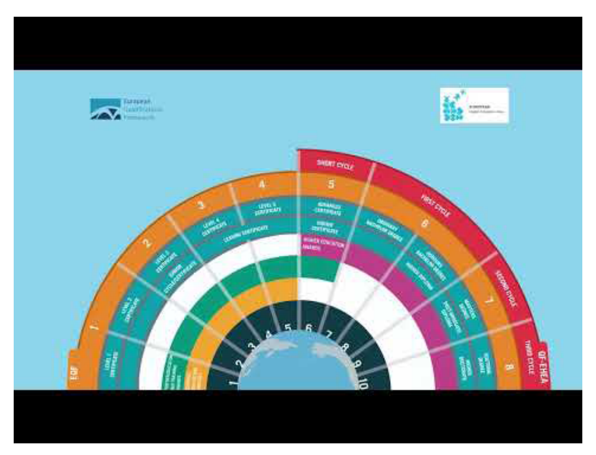
Figure 5: National Framework of Qualifications [1:23 min, YouTube]

This expectation is also made explicit in Part 1 of the ESG.