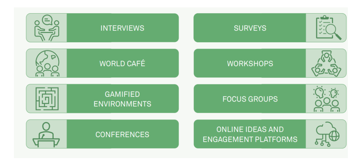
Figure 6: Potential Engagement Methodologies

Different methodologies, tools, documentation and supports may be required to ensure the effective participation of the various stakeholder groups – including diverse learner cohorts. The self-evaluation steering group should reflect carefully on the heterogeneity of its stakeholders and seek to adopt methodologies that are designed to facilitate high levels of engagement with, and meaningful outputs from, the groups concerned. It may wish to employ different sessions/ methodologies for different themes and sections. Several potential methodologies of engagement are outlined in Figure 3 below: however, it is recommended that the institution is flexible and creative in considering approaches.