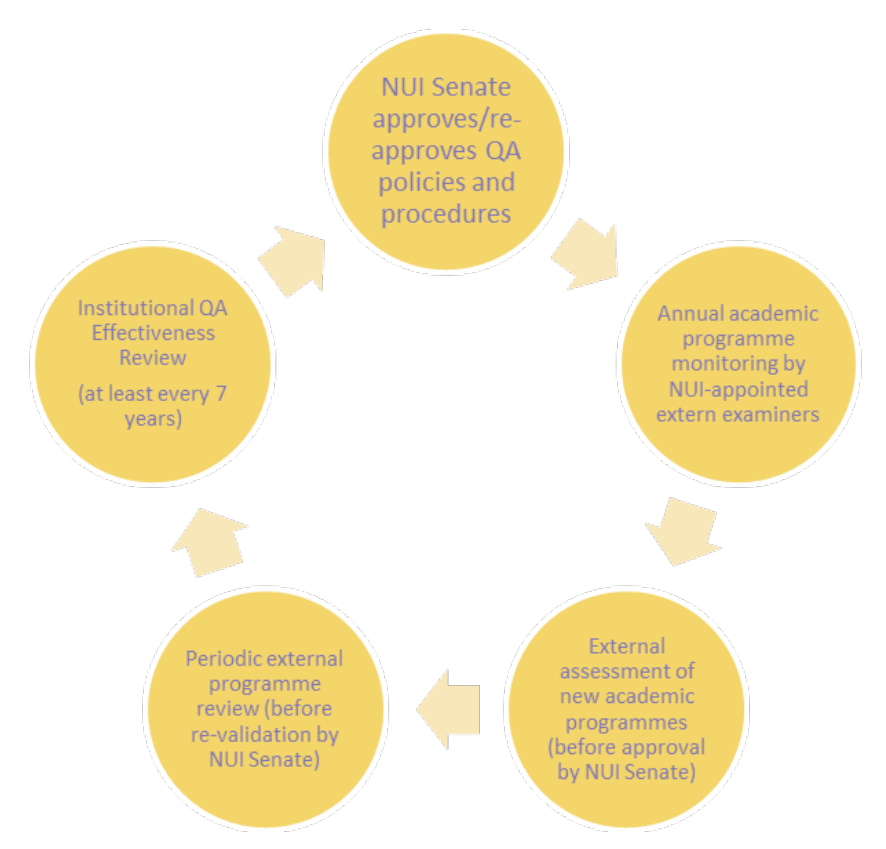
Figure 1: NUI QA oversight and monitoring cycle for recognised colleges that are linked providers