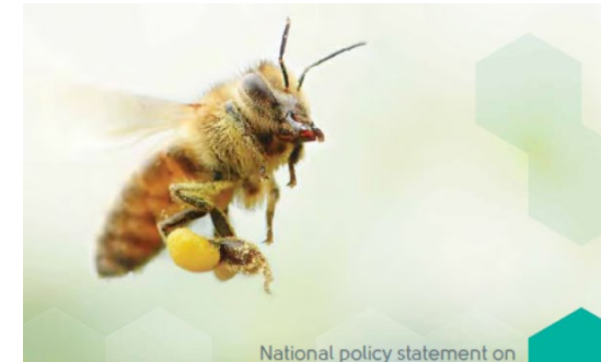
Policy Statement on Ensuring Research Integrity in Ireland