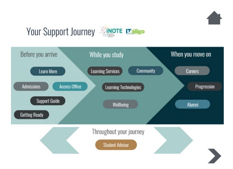
Figure 2: Your Support Journey