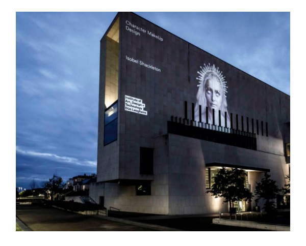
A promotional video about the exhibition is available from the IADT YouTube Channel

The full graduate exhibition, 'On Show 2021' is available online at https://onshow.iadt.ie.