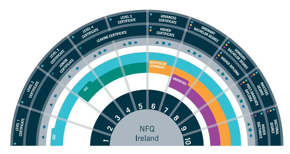
For more detailed information about the NFQ, please visit our website: www.nfq.ie

QQI issues quality assurance guidelines to providers, conducts regular evaluations, sets standards for qualifications, collects data on student completion rates, and engages in initiatives supporting the improvement of quality of education programmes.